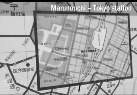
Marunouchi - Tokyo station